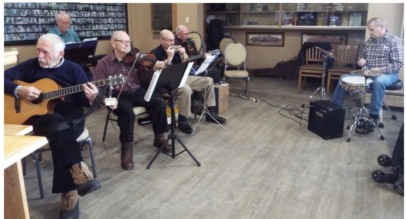
And The MusicMakers Played On